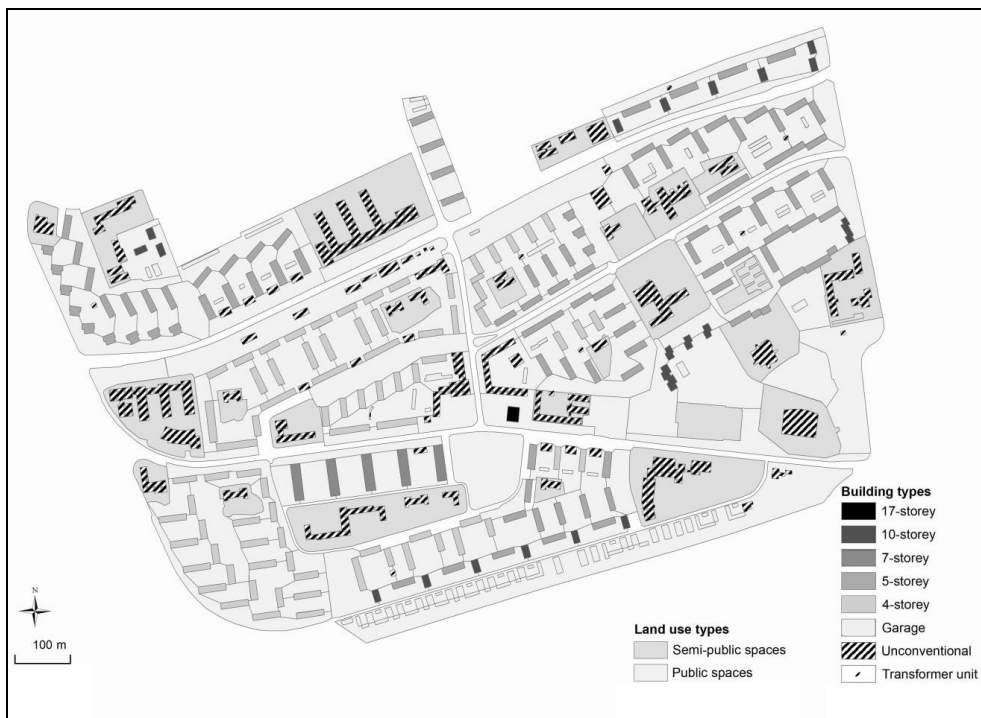
Fig. 1: The spatial structure and building types of Úránváros (ed.: Bognár Z. 2012).

condition, number of storeys, arrangement of buildings, etc.), its inhabitants (age, occupation, family status, incomes, etc.), as well as in its public spaces. Because of this diversity, Úránváros is a particularly suitable subject in the study and field research of development routes leading from traditional districts to rehabilitated housing estates.