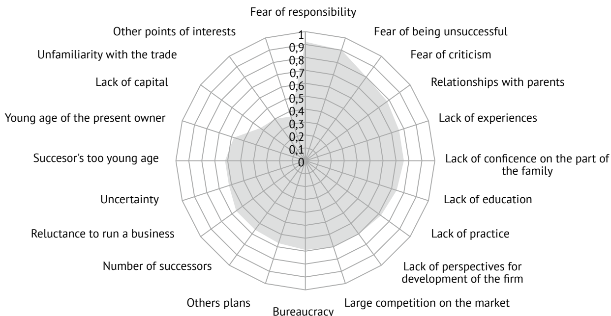
Figure 1. Profile of barriers in succession process from the successor's point of view ( n = 25 ).

Results are expressed as the weighted means.