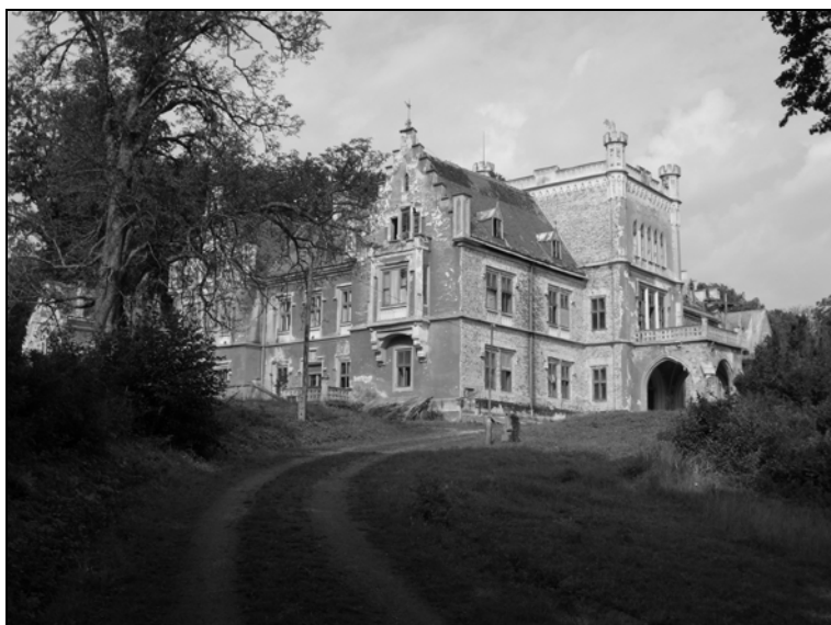
Fig. 7: A manor house in bad condition on the outskirts of Mikosszéplak.

Although manors – similarly to scattered farms – are usually located on the outskirts of towns and villages, there are 9 allodiums in West Transdanubia that have become sovereign settlements by now. All of them are in the category with a substantial number of inhabitants. On the other hand, a significant proportion of the outskirts with original manor buildings are often inhabited by disadvantaged, impoverished social layers.