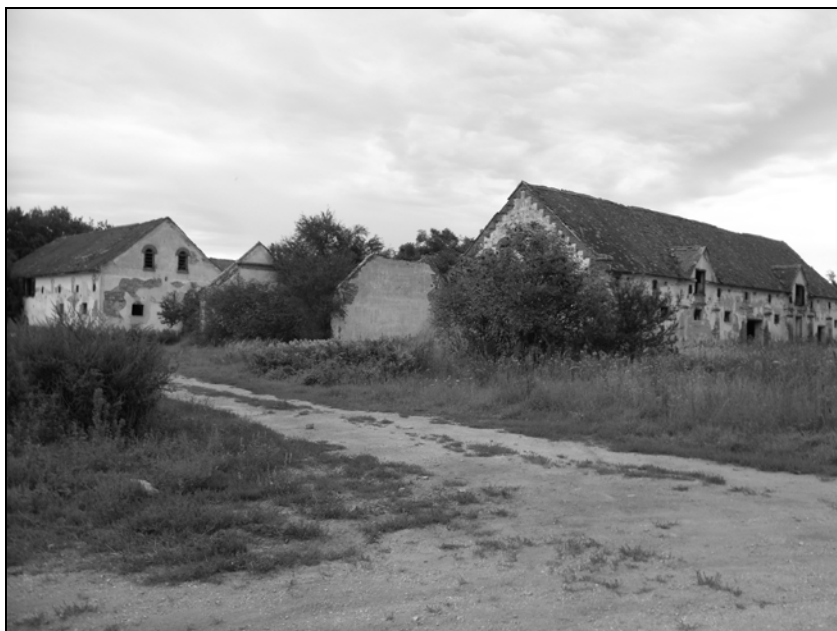
Fig. 2: A manor in Transdanubia.