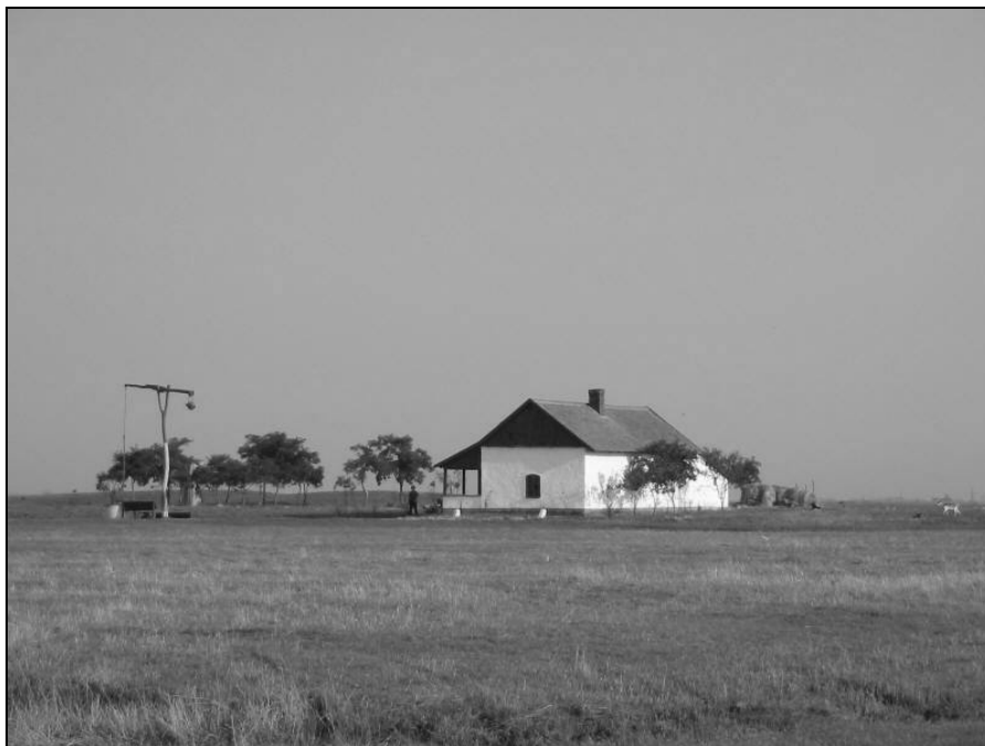
Fig.1: A scattered farm in the Great Hungarian Plain.

Scattered farms are most often seen as successors of the “outskirts gardens” having gone through a change of function. Outskirts gardens were land areas in private use and appeared as early as in the 16 th and 17 th century. They originally served the purposes of animal husbandry: they were winter shelters for the livestock taken out from the common herds or flocks, they were the places where fodder was collected and stored, and manure was used to cultivate the land. In other words: animal husbandry was accompanied by the cultivation of the land. If the cultivation of the land and stable-based, indoor animal husbandry became more important in the farming structure of these dwellings, i.e. when a more permanent settlement took place, a scattered farm was born (Beluszky 1999, 100). The first scattered farms thus were economic units established in the outskirts gardens, dividing the vast pastures of the “puszta”, the waste land (Frisnyák 1990, 86). The majority of the scattered farms was later established independent of the outskirts gardens, when it became necessary or possible to create “farming centres” on the outskirts (e.g. after the formerly common lands became private holdings).