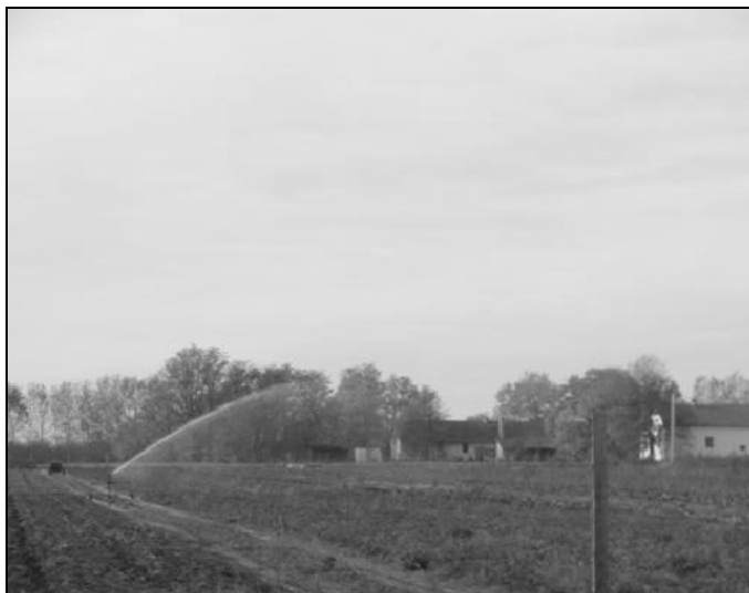
Fig. 4: A farm doing agricultural activity, Szatymaz.