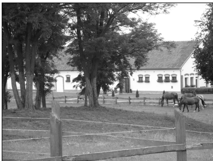
Fig. 9: Equestrian tourism in Mórchelypuszta, a part of Nagykanizsa.