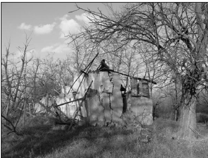
Fig. 3: A decaying scattered farm, Kiskunmajsa.