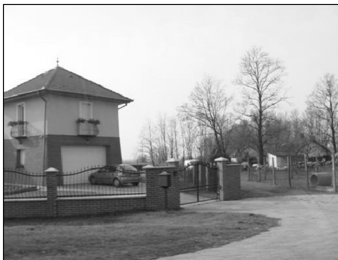
Fig. 5: A suburban residential farm on the outskirts of Kecskemét.