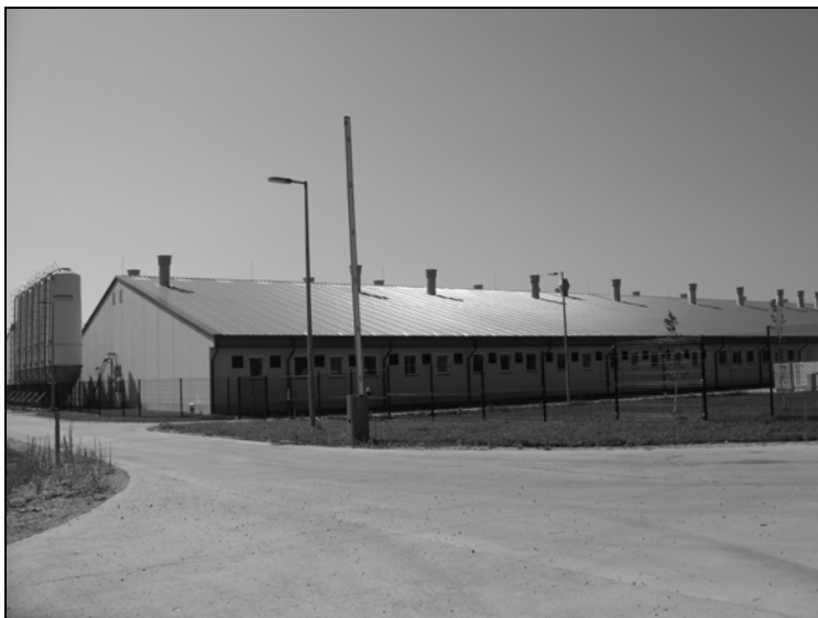
Fig. 8: Modern pig farm on the outskirts of Pusztacsó.

that are used but it happens in some cases, especially for keeping horses. In five manors – one in Győr-Moson-Sopron and four in Zala county – touristic activity can be a function on its own (wellness, equestrian schools, animal petting, reserve, holiday resort).