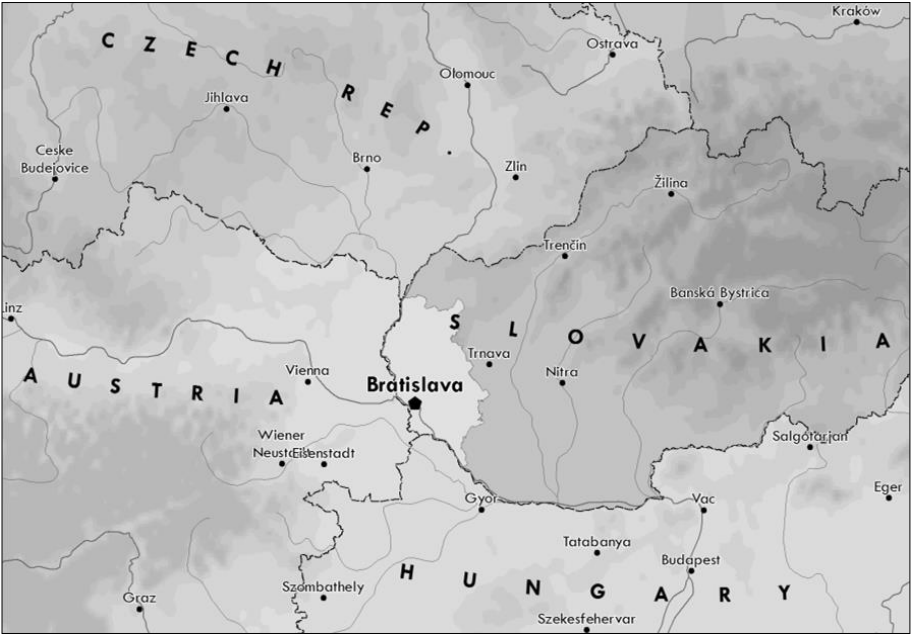
Fig. 1: Location of functional urban region of Bratislava within Central Europe.