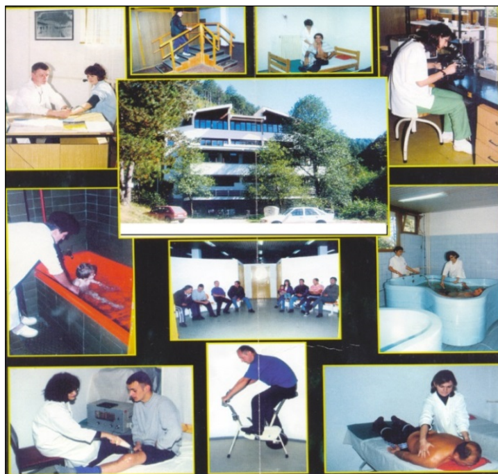
Fig. 6: Providing services in CFM Argentina until 1992.

The information available to the Tourist Organization of Srebrenica is the sum of all announced one-day individual and group visits to the city of Srebrenica, in a tour of the cultural motives of this area. Also, many visitors come unannounced, so the actual number of visits is even higher. According to the data obtained by the author from the Tourist Organization, in 2016, about 30.000 visitors visited Srebrenica, but it is impossible to determine the exact number, since the official statistics register only visitors who spent the night.