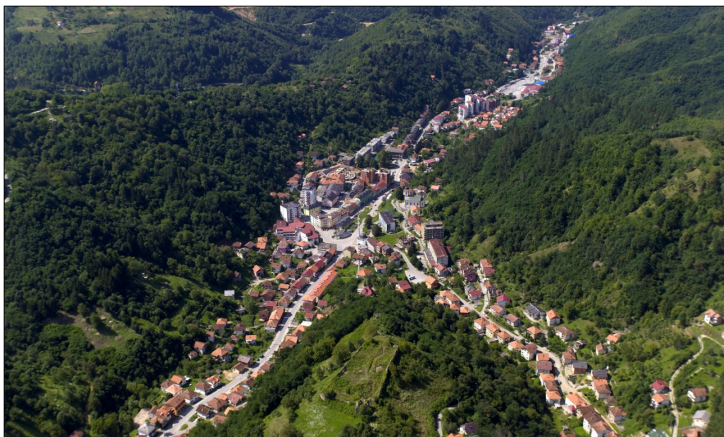
Fig. 1: Summer climatic ambience of the spa resort Srebrenica.

The municipality has a favorable geographical position towards the larger city centers of Sarajevo and Belgrade, primarily due to the distance of up to 200 km. The movement of visitors from the area of Northern Bosnia towards Srebrenica is directed through the Tuzla valley, which is 92 km away. The connection of Srebrenica to Northern and Central Bosnia is expressed by the main roads M-4 Zvornik, Tuzla and M-19 Srebrenica, Vlasenica, Sarajevo. In the erosive extension of the river Križevica, at 370 meters above sea level, the city center of Srebrenica stretches in a south-north direction for 4 km.