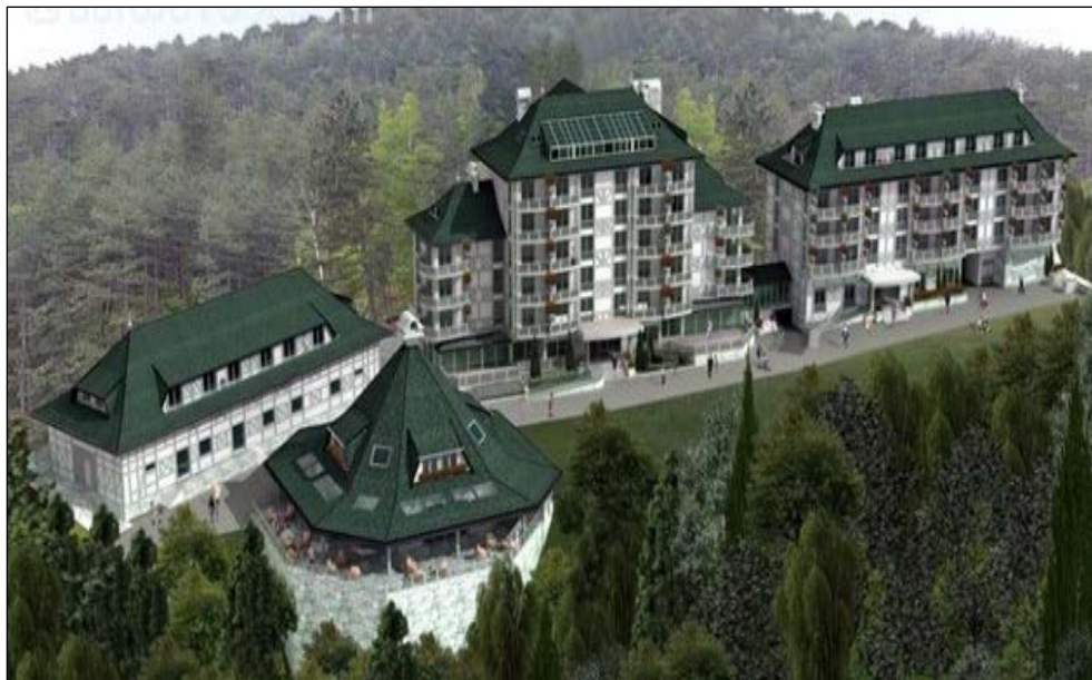
Fig. 5. Banja Guber, in the construction of a model of tourist facilities.

patients in 1991 was 6.2 days for domestic and 10.1 days for foreign visitors. Domestic visitors dominated the total tourist traffic with 98.1%, foreign with 1.90%.