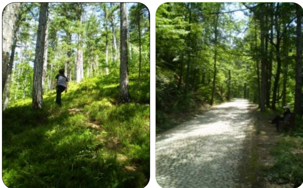
Fig. 3: Landscape area on the slopes of the mountain Kvarc towards the source Veliki Guber