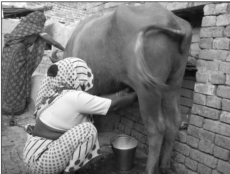
Fig. 3: Women from Marginal Farms Milking Buffalo.