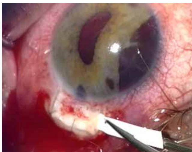
Figure 5. The proper size of the PRECLUDE® pericardial membrane band was obtained by cutting with a scissors approximately 7 mm long and 2 mm bright. The membrane was grasped with fine forceps, as gently as possible, and pushed under the scleral flap.

Trabeculotomy is still the most effective treatment for patients with progressive glaucoma (28,29). The most common cause for failure of trabeculotomy for glaucoma surgery is fistula blockage caused by