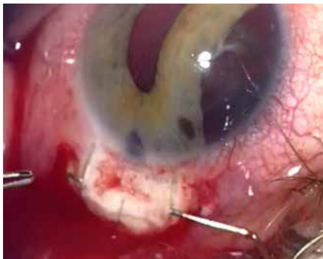
Figure 4. A very thin spatula was used for complete dissection of the flap from the underlying sclera.

Since the first description of trabeculotomy in 1968, it has become a standard in the surgical treatment of glaucoma. With this fistulising treatment, a drainage system is created through which the aqueous humour is drained from the anterior chamber of the eye into the subconjunctival space to reduce intraocular pressure.