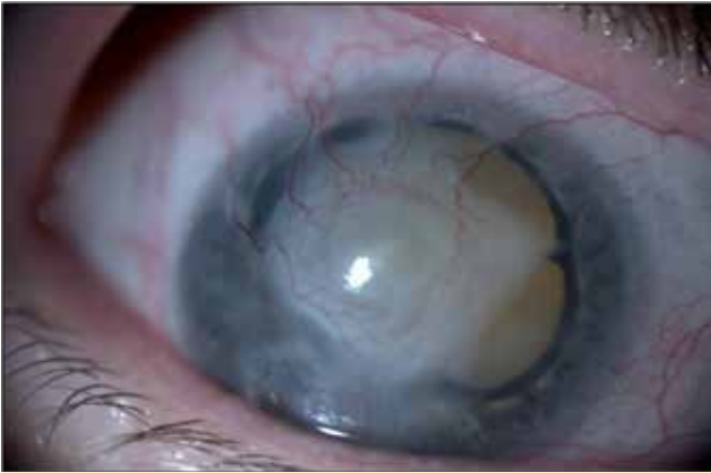
Figure 3. Three months after surgical treatment, the e-PTFE membrane was removed. The underlying cornea was thin, firm, stable, and completely vascularised, and the deep anterior chamber was normal. Intraocular pressure was normal after treatment with local anti-glaucoma medication (by permission of Full Prof. Dušica Pahor).

The follow-up period was free of complications. The e-PTFE membrane was removed 3 months after the surgical procedure in the patient with granulomatosis with polyangiitis and in the patient with vasculitis, and 8 months after the surgical procedure in the patient with Sjögren's syndrome. The underlying cornea was thin, firm, stable, and completely vascularised (Fig. 3). Intraocular pressure was normal in all cases; in case 1, local pressure-reducing treatment was required. In all patients, intraocular pressure was measured using digital tonometry.