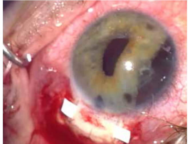
Figure 6. The membrane was grasped with fine forceps, as gently as possible, and pushed under the scleral flap.

A Gore® PRECLUDE® pericardial membrane measuring 8.0 × 16.0 cm and a thickness of 0.1 mm was used. A small section was cut from the membrane,