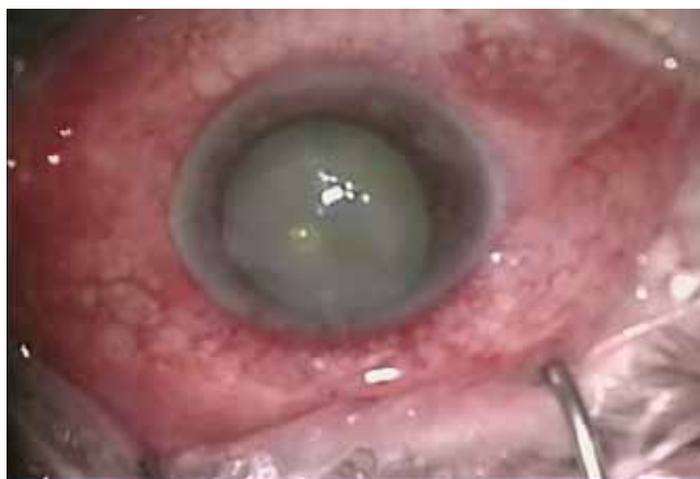
Figure 1. Large, deep corneal ulcer with a small perforation.

Corneal perforation was successfully covered with an e-PTFE membrane, and the anterior chamber was reconstructed (Figs. 1 and 2). None of the patients had any pain or other complaints. No sign of infection or inflammation was observed during the follow-up.