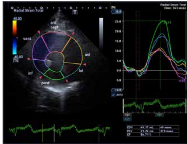
Figure 2. Screenshot. Measurement of the left ventricular radial myocardium strain in 2D speckle-tracking mode. Parasternal position along the short axis of the left ventricle at the level of the papillary muscles of the mitral valve.

Myocardial thickness values were converted into units of standard deviation in the population (z-score factor), which amounted to 4.29Z (8). In the 2D speckle-tracking mode, the global and segmental longitudinal, circular, and radial myocardial strain was evaluated in 12 segments of the basal and middle parts of the left ventricle (Fig. 2).