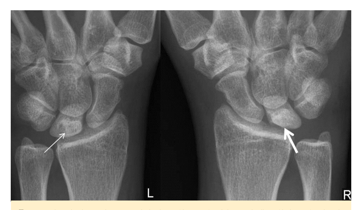
Figure 1. Plain film showing the fissure of the left lunate (thin arrow) and the partial collapse (thick arrow) of the right lunate. Note also the bilateral NUV.

Plain films (Figure 1) showed a fissure of the lunate on the left wrist, and bilateral NUV, which was -3 mm on the right arm, and -2.5 mm on the left arm according to the Gelbermann method (7). There were