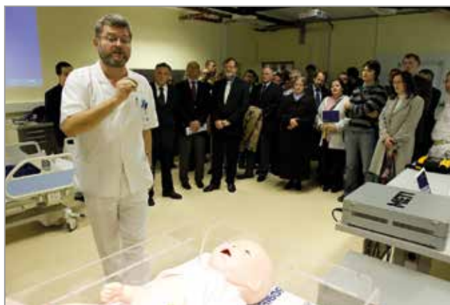
Slika / Figure 3: Odprtje Simulacijskega centra / Opening of the Simulation centre (on November 3, 2009)

na univerzitetni študijski program Splošna medicina. V študijskem letu 2009/2010 se je vpisala prva generacija študentov po prenovljenem, z bolonjsko deklaracijo usklajenem programu enovit magistrski študijski program Splošna medicina, ki ga je potrdil Svet za visoko šolstvo Republike Slovenije 5. maja 2008. Značilnost tega prenovljenega študijskega programa je tesna prepletenost predmetov znotraj posameznih letnikov (horizontalno) in med letniki (vertikalno). Vlogo povezovalca imajo PBL-moduli, ki na osnovi središčnih problemov v obliki spirale pokrivajo vsa področja medicine od poznavanja temeljev teorije in prakse, usposabljanja v kliničnem okolju in postopnega doseganja samostojnosti. Vse to študente pripelje na samostojno pot odgovornega, empatičnega in z visoko mero etike opremljenega zdravnika. V horizontalnem smislu so predmeti v posameznih letnikih vsebinsko povezani in integrirani. Tako je histologija integrirana v anatomijo, patofiziologija pa celo v več predmetih: od fiziologije, patologije, farmakologije s toksikologijo, PBL-modulih, v vseh kliničnih predmetih.