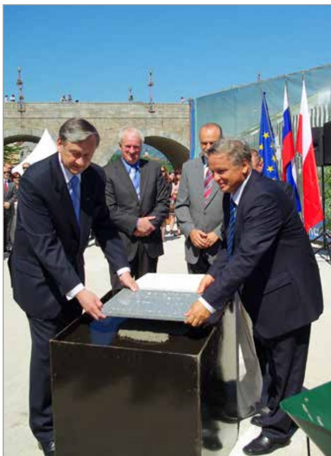
Slika / Figure 6: Postavitev temeljnega kamna / Foundation stone laying ceremony on the June 20, 2011

Nove možnosti, tako prostorske kot glede vrhunske opreme, omogočajo razvoj predvsem bazičnih predkliničnih raziskav. Študentje in učitelji lahko v pedagoški proces vključujejo najsodobnejše simulatorje, virtualne bolnike, laboratorij za prakticanje kliničnih veščin, elektronske mize za pouk anatomije, sodobno opremo za diagnostiko bolezni prebavil in ginekološke bolezni, sodobne ultrazvočne aparate, aparate za diagnostiko in zdravljenje gibal, uporabo telemedicine, video-konferenčne prostore itd.