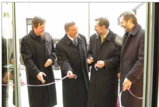
Slika / Figure 2: Odprtje Laboratorijskega centra / Opening of the Laboratory Centre (on January 27, 2006)