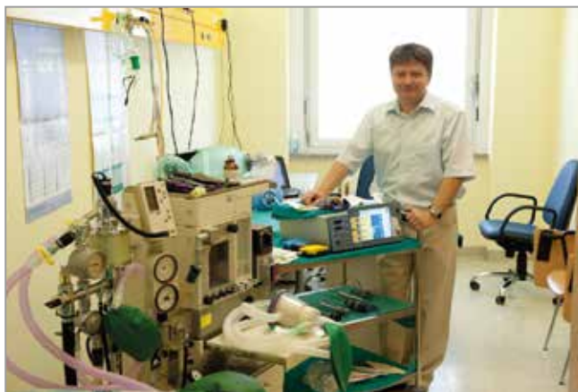
Slika / Figure 4: OSCE laboratorij / OSCE-laboratory (opened on June 11, 2010)

biofiziko, biologijo celice, farmakologijo s toksikologijo, genetiko itd. (odprtje 27. 1. 2006) (Slika 1, 2).