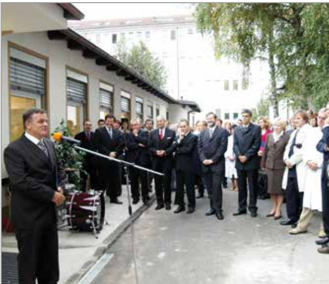
Slika / Figure 1: Odprtje Inštitutov za anatomijo, histologijo in embriologijo ter Inštituta za fiziologijo / Opening of the Institute for Anatomy, Histology and Embryology and the Institute for Physiology (on September 30, 2004)

Svoje pedagoške vrline so kalili tudi pri delu s študenti Medicinske fakultete Univerze v Ljubljani, ki so prihajali v Splošno bolnišnico Maribor na klinične vaje v večjem številu že od 1990. leta dalje. Pedagoško so sodelovali pri kliničnem delu na Višji in pozneje na Visoki zdravstveni šoli v Mariboru, kakor tudi na Medicinski fakulteti Univerze v Ljubljani (1, 2).