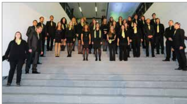
Slika / Figure 7: Študijsko leto 2013/14 se je začelo v novih prostorih / The academic year 2013/2014 started on the new premises

Zazreti se moramo v nove čase, saj smo za rast in razvoj zavezani vsem, ki so nas podprli: v prvi vrsti lokalnemu okolju, vključno z Univerzo v Mariboru, državi in Evropi, in ne nazadnje tudi našim študentom. Taborsko nabrežje je z Medicinsko fakulteto Univerze v Mariboru poslej kraj pomembnega nacionalnega središča medicinskega znanja (9).