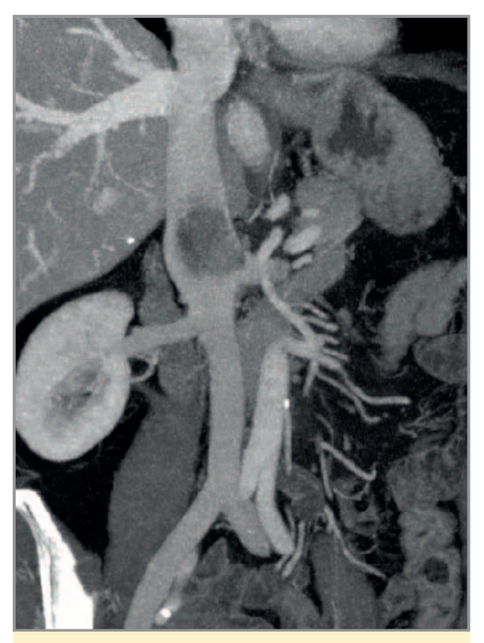
Figure 1. CT image of the growth - height measured in coronal section was 42 mm, volume 15 cm3. The influx of the left and right renal vein is also visible.

The preoperative CT scan, coupled with a magnetic resonance imaging (MRI) scan, confirmed that the tumor, presumably a leiomyosarcoma, was located within the IVC. Due to the location of the tumor in segment II of the IVC and involvement of the left renal vein, a radical resection with vascular prosthetic reconstruction was chosen.