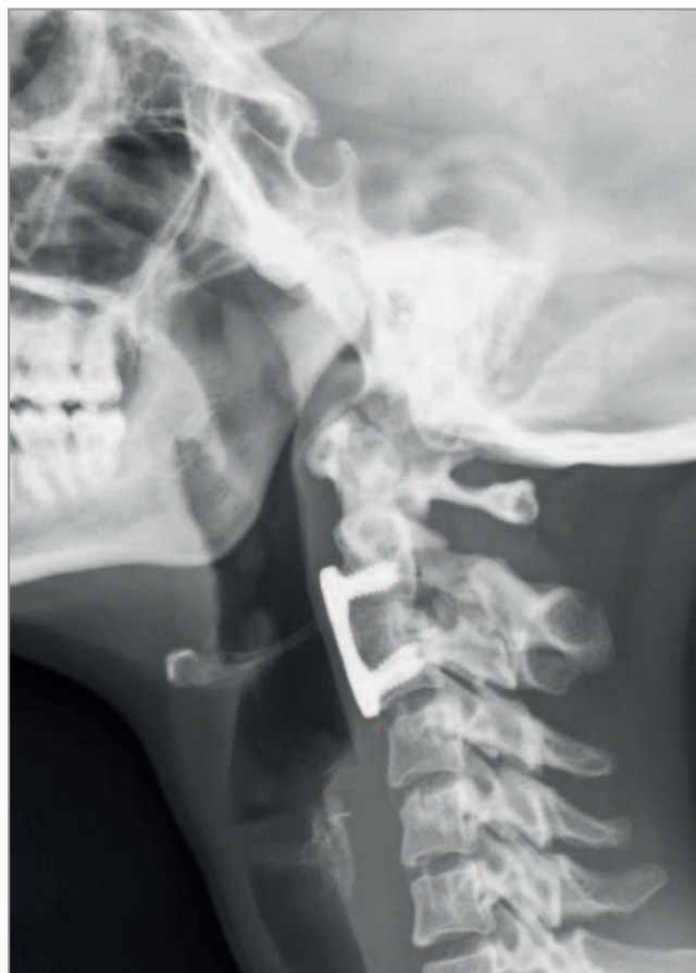
Figure 4. Lateral x-ray image 6 month postoperatively showing sound bone C2/C3 fusion