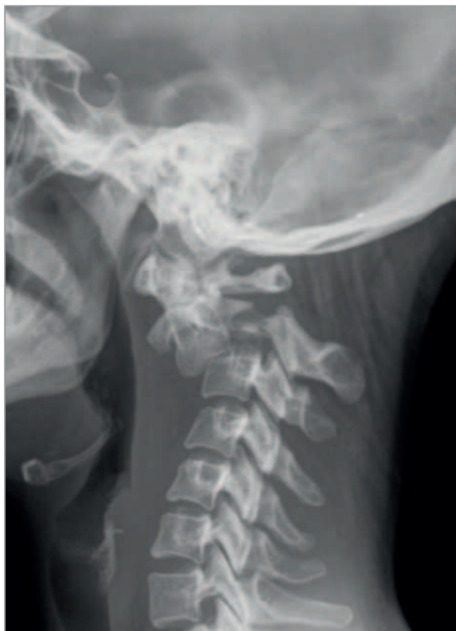
Figure 3. Lateral x-ray image showing a type II TSA with severe angulation and translation.